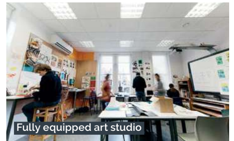
Fully equipped art studio