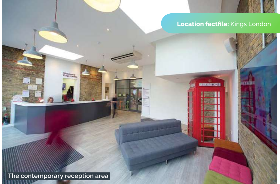
The contemporary reception area