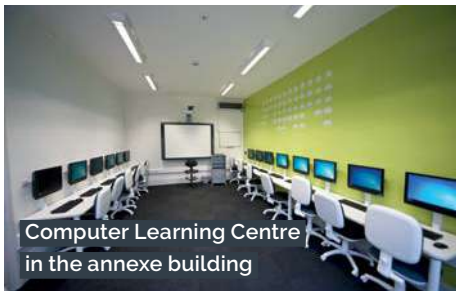
Computer Learning Centre in the annexe building