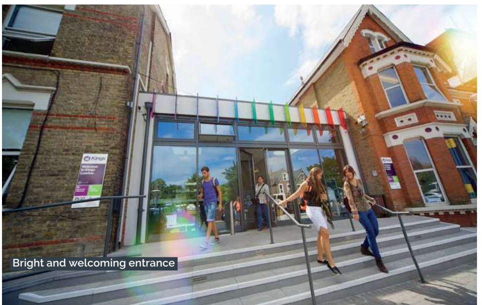
Bright and welcoming entrance