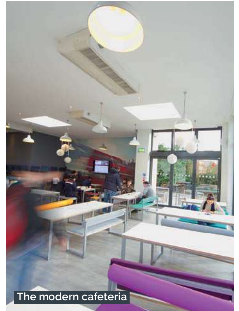
The modern cafeteria