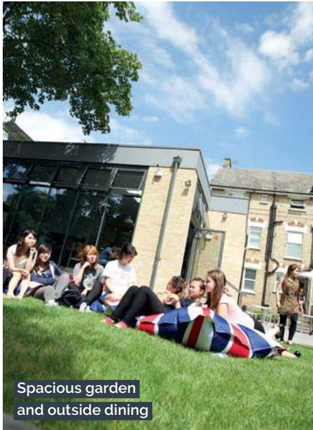
Spacious garden and outside dining